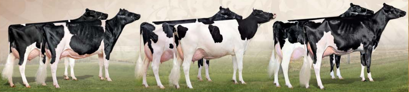
Arethusa Durham Angela EX-91, Angel dtr Arethusa Affection EX-92, Angel dtr All-American Milking Yearling